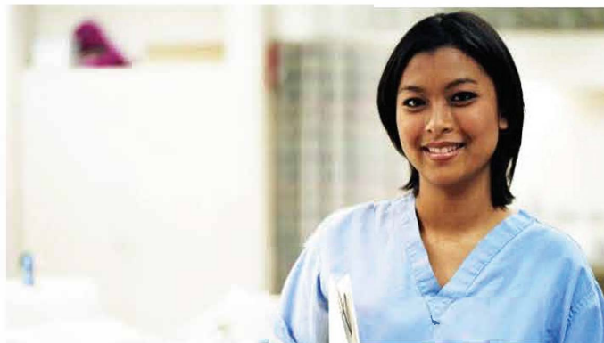
📌 Nurses can claim uniforms, equipment, self education and registration fees come tax time.